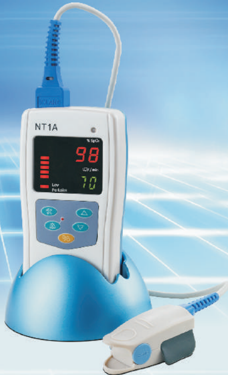
NT1A (w/ Alarm)